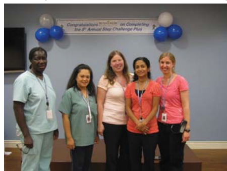
RHC staff members that took part in the 5 th Annual Step Challenge Plus

To celebrate, recognize and raise awareness the Physiotherapy Team at the hospital hosted their 5 th Annual Step