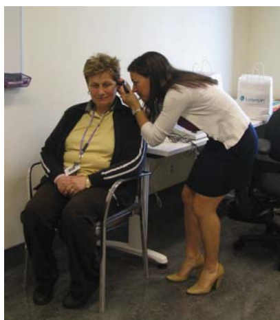
Hearing Screenings with ListenUp! Canada

RHC's Speech-Language Pathology team work collaboratively to improve and maintain patient's speech and language abilities through individual or group therapy. The department runs cognitive-communication groups of different levels and a current events group on a weekly basis as well as an interprofessional music therapy program in partnership with RHC's Activation team.