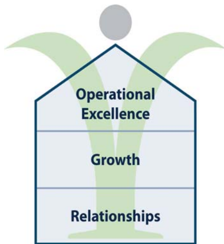
Runnymede Healthcare Centre Strategic Directions 2011-2014

At Runnymede Healthcare Centre (RHC) we recently launched our Strategic Plan 2011-2014.