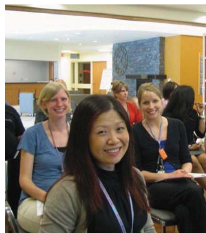
RHC Staff at the Speech and Hearing Awareness Event

The Speech-Language Pathology team at RHC did their part in raising awareness about communication disorders. The aim was to encourage detection and prevention of communication disorders and increase the public's sensitivity to the challenges faced by individuals experiencing them. RHC welcomed the hearing aid provider, ListenUp Canada!, as they presented an educational session about hearing health and conducted hearing screenings for RHC staff members.