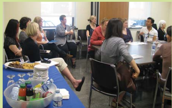
RHC's Open House with visitors from St. Michael's Hospital

Members of the RHC interprofessional team provided attendees, including Senior Team Members, Discharge Planners, Patient Flow Coordinators, Social Workers and Managers from the large Acute Care hospitals with a tour of the facility and an overview of the programs and services on offer at RHC.