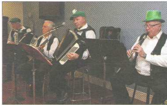
And the band, Irish Jubilee, played on...