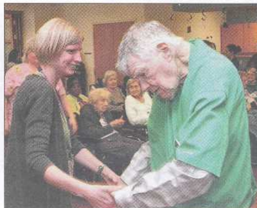
Dancing an Irish jig