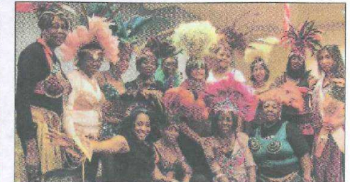
Many of the colourful Carnival performers gather to get SNAP'd